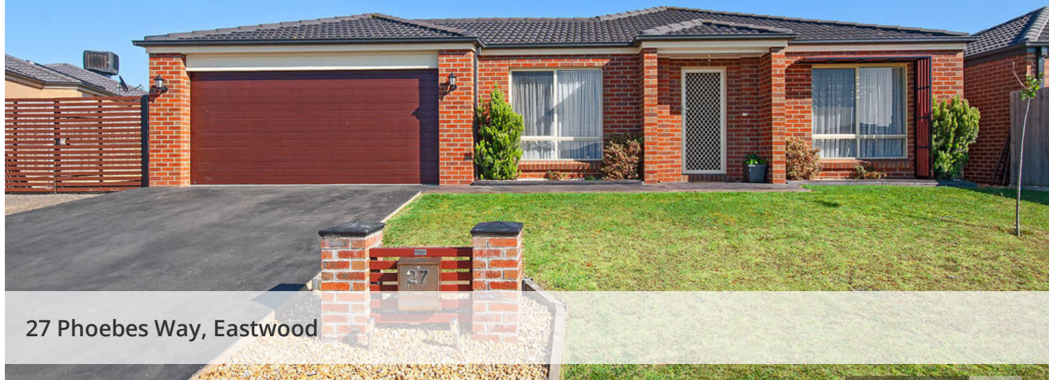
27 Phoebe Way, Eastwood