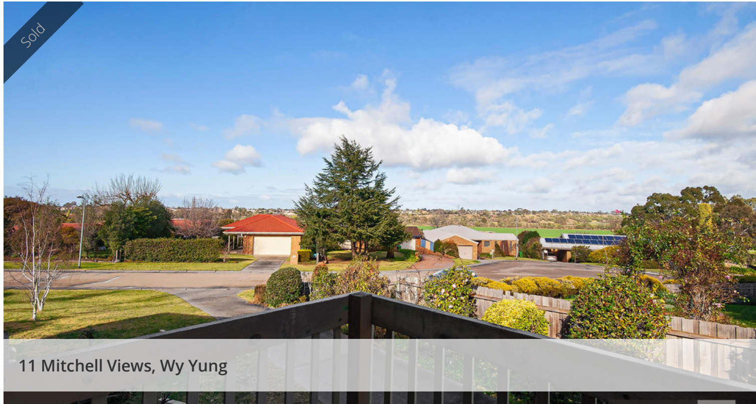
11 Mitchell Views, Wy Yung